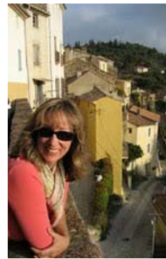
Me in Roquebrun, France, our future home.